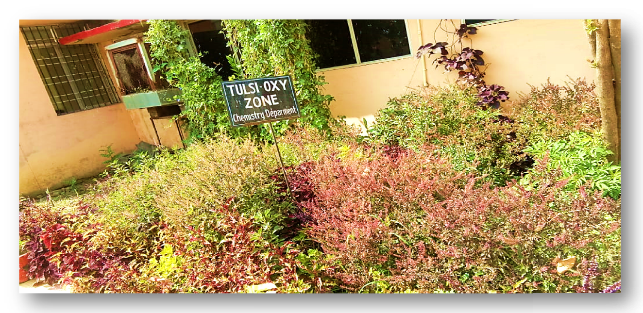
TULSI – OXY ZONE